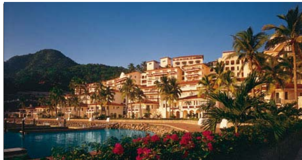
The Wyndham Grand Bay, Isla Navidad Resort in Manzanillo, Mexico (above) will host the 2009 Annual Meeting of the IBNS. The most up-to-date Annual Meeting information is available on our web site. For more information on Manzanillo, see Page 2.